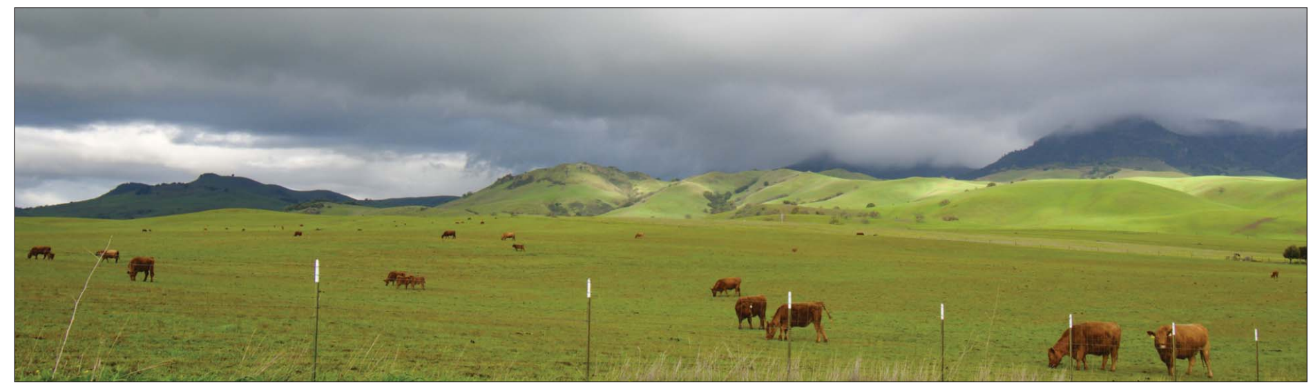
Above: Cattle on pastures with storm clouds.